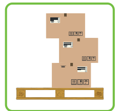
An incorrectly loaded pallet