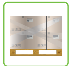
A correctly loaded pallet